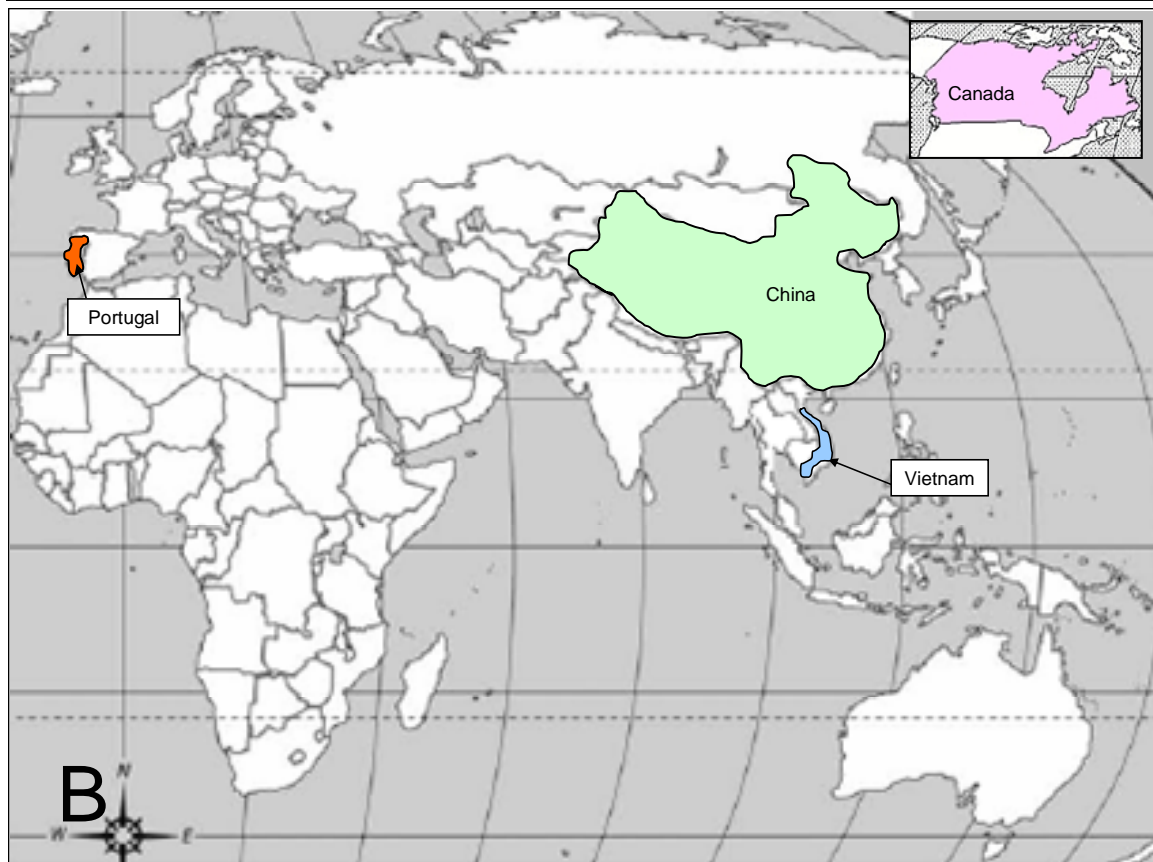
(A) Human infection of avian influenza (H5N1) since Jan 2004 (as of 13 October 2007) and (B) Avian influenza in birds reported from 13 September to 13 October 2007.

Avian Influenza Report is a weekly report produced by Respiratory Disease Office of Centre for Health Protection during the alert level of Government's Preparedness Plan for Influenza Pandemic in Hong Kong. This report aims to highlight any important international development of avian influenza preparedness and control and to monitor global avian influenza activity in human and birds.