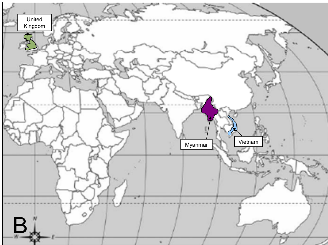
(A) Human infection of avian influenza (H5N1) since Jan 2004 (as of 17 November 2007) and (B) Avian influenza in birds reported from 17 October to 17 November 2007.

Avian Influenza Report is a weekly report produced by Respiratory Disease Office of Centre for Health Protection during the alert level of Government's Preparedness Plan for Influenza Pandemic in Hong Kong. This report aims to highlight any important international development of avian influenza preparedness and control and to monitor global avian influenza activity in human and birds.