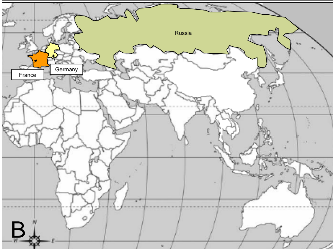
(A) Human infection of avian influenza (H5N1) since Jan 2004 (as of 8 September 2007) and (B) Avian influenza in birds reported from 8 August to 8 September 2007.

Avian Influenza Report is a weekly report produced by Respiratory Disease Office of Centre for Health Protection during the alert level of Government's Preparedness Plan for Influenza Pandemic in Hong Kong. This report aims to highlight any important international development of avian influenza preparedness and control and to monitor global avian influenza activity in human and birds.