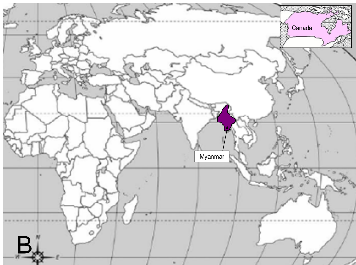
(A) Human infection of avian influenza (H5N1) since Jan 2004 (as of 10 November 2007) and (B) Avian influenza in birds reported from 10 October to 10 November 2007.

Avian Influenza Report is a weekly report produced by Respiratory Disease Office of Centre for Health Protection during the alert level of Government's Preparedness Plan for Influenza Pandemic in Hong Kong. This report aims to highlight any important international development of avian influenza preparedness and control and to monitor global avian influenza activity in human and birds.