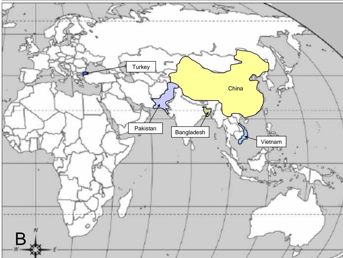
(A) Human infection of avian influenza (H5N1) since Jan 2004 (as of 22 March 2008) and (B) Avian influenza in birds reported from 22 February to 22 March 2008.

Avian Influenza Report is a weekly report produced by Respiratory Disease Office of Centre for Health Protection during the alert level of Government's Preparedness Plan for Influenza Pandemic in Hong Kong. This report aims to highlight any important international development of avian influenza preparedness and control and to monitor global avian influenza activity in human and birds.