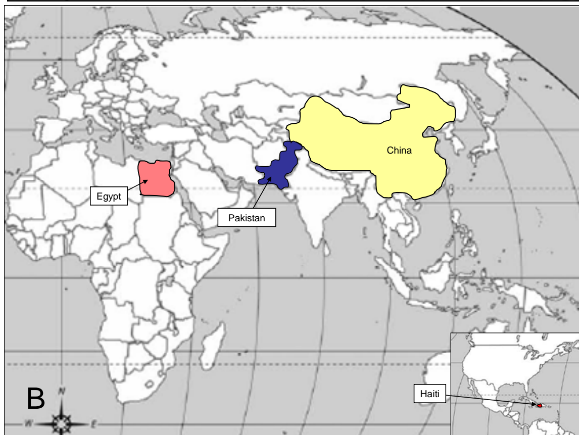
(A) Human infection of avian influenza (H5N1) since Jan 2004 (as of 12 Jul 2008) and (B) Avian influenza in birds reported from 12 Jun to 12 Jul 2008.

Avian Influenza Report is a weekly report produced by Respiratory Disease Office of Centre for Health Protection during the alert level of Government's Preparedness Plan for Influenza Pandemic in Hong Kong. This report aims to highlight any important international development of avian influenza preparedness and control and to monitor global avian influenza activity in human and birds.