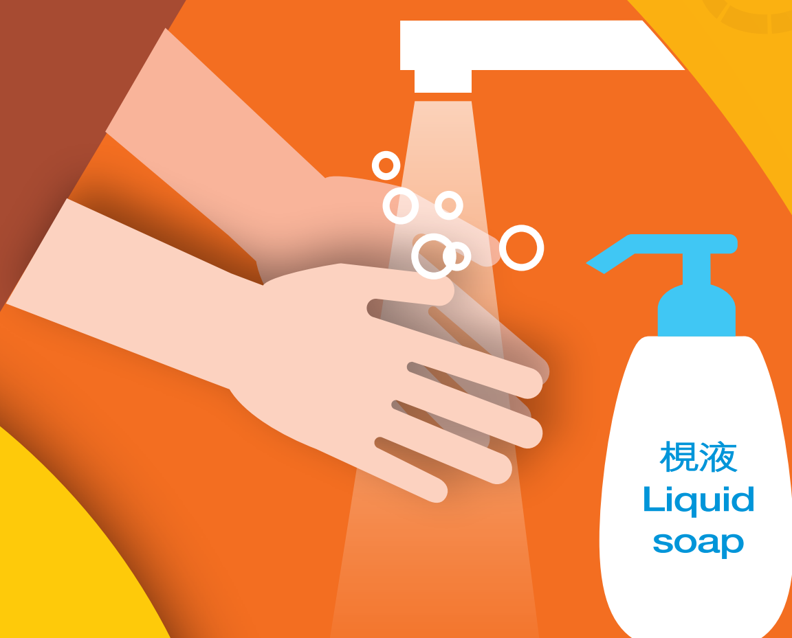
梘液 Liquid soap

保持良好的手部衛生；在觸摸口、鼻或眼之前切記先以梘液或酒精搓手液清潔雙手 Observe good hand hygiene, always remember to use liquid soap or alcohol-based handrub to clean your hands before touching the mouth, nose or eyes