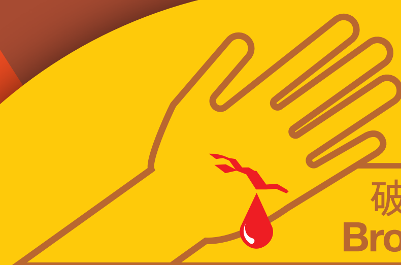
破損皮膚 Broken skin