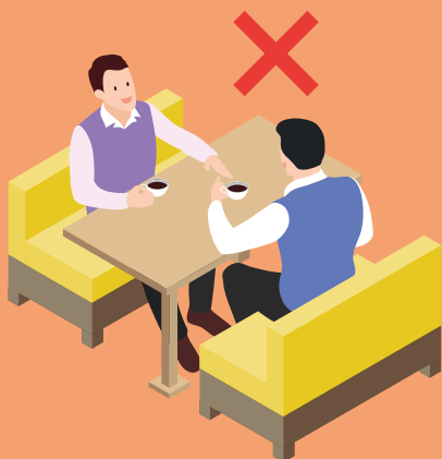
Minimise face-to-face contact