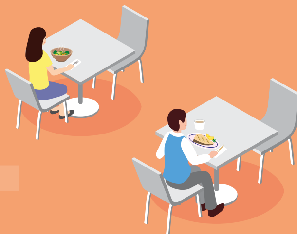
Allow sufficient distance between tables