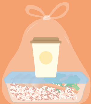
Buy takeaway meals